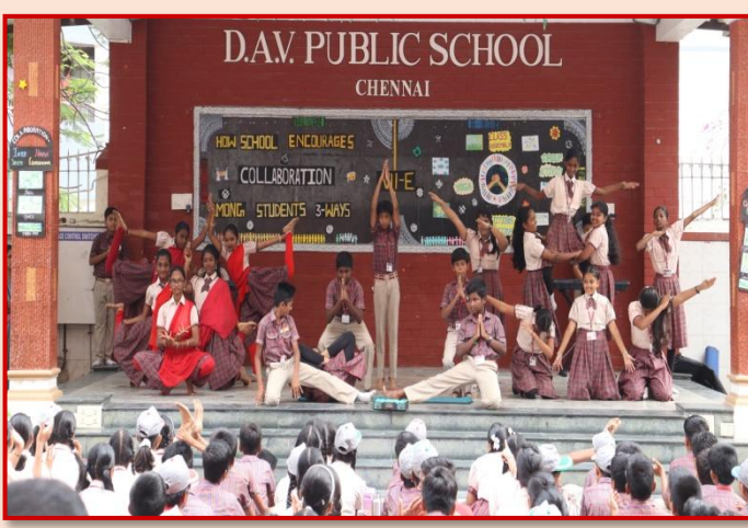
Together We are Unstoppable – Sensational Swifters