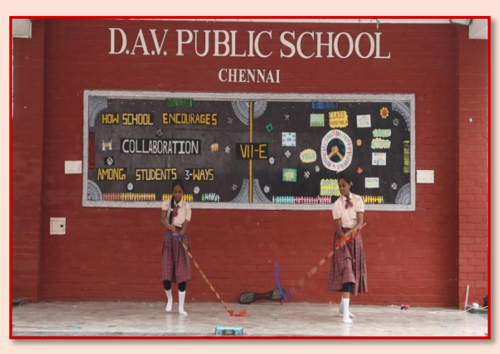
Glimmering and Sizzling Sticks -Silambam