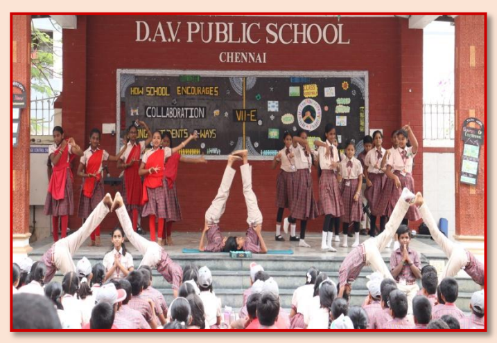
Moving and Creating Together – Fusion Magic