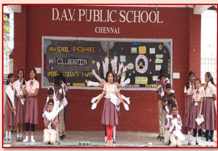
Collaboration in Motion, Harmony in Action