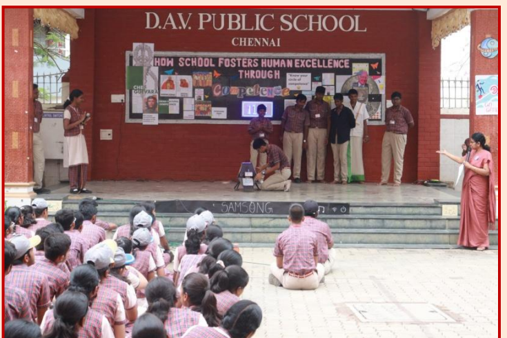
Teacher In-charge appreciating the Assembly Invitation