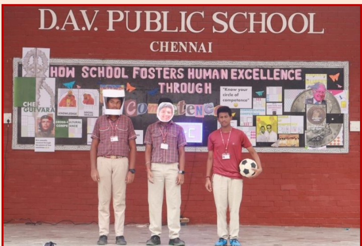
Conversing with One's Inner Self