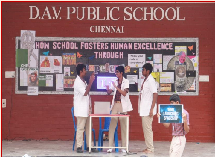
Conquering the Cosmos with Competence