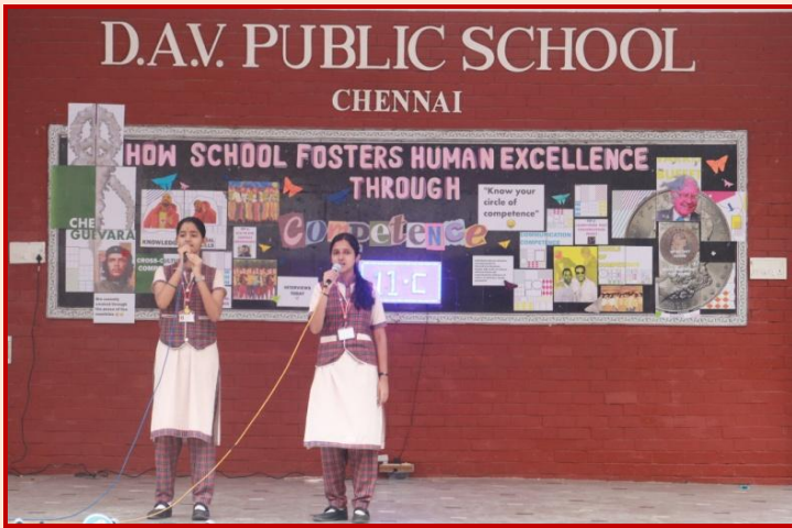
Welcoming the Congregation with a Song