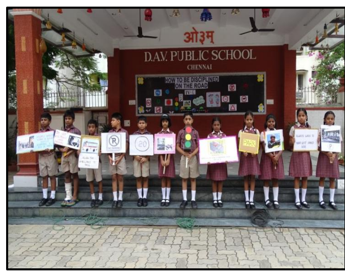
Slogans Highlighting Road Safety Rules