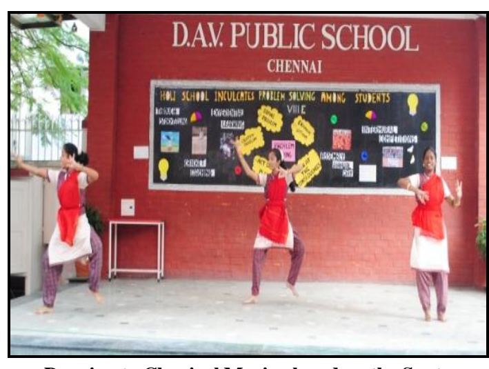
Dancing to Classical Music played on the Spot