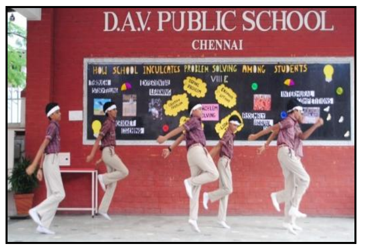
Performing to a Foot Tapping Number played on the Spot