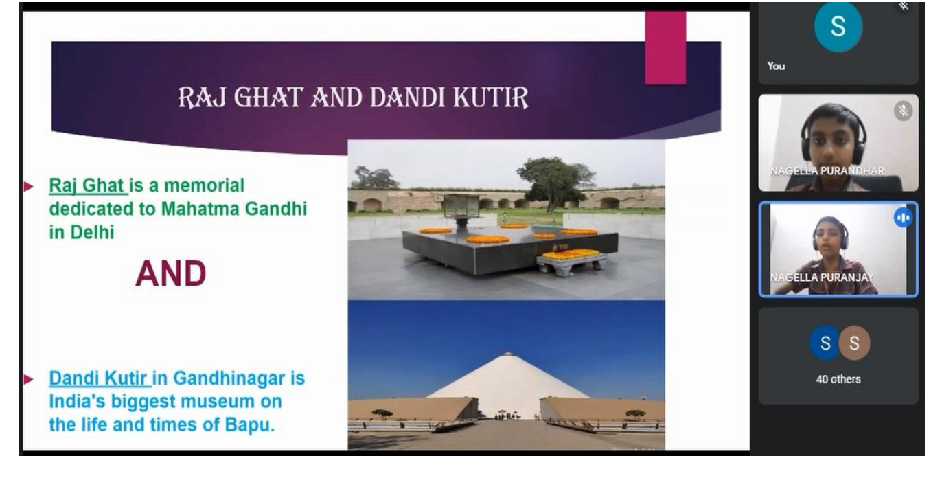
Gandhij`s memorial and museum