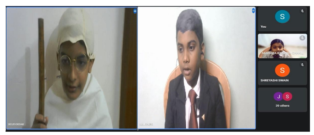
Talk Show on the Two Great Leaders