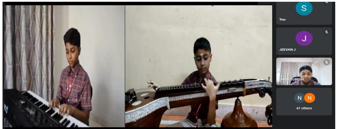
Instrumental - Playing to the tune of Ragupati Raghav Raja Ram