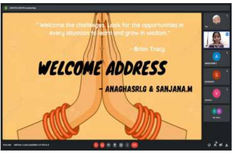
A Sweet and a Versatile Greeting to Welcome the Gathering