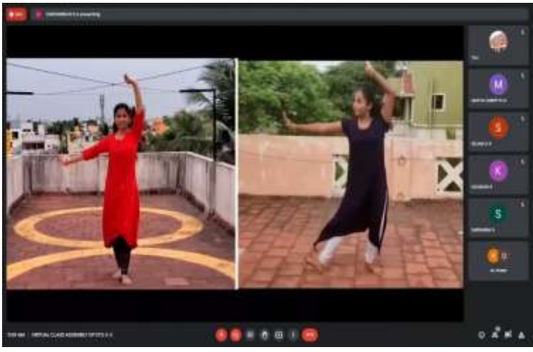
Dazzling Dance Performance – AGE Event