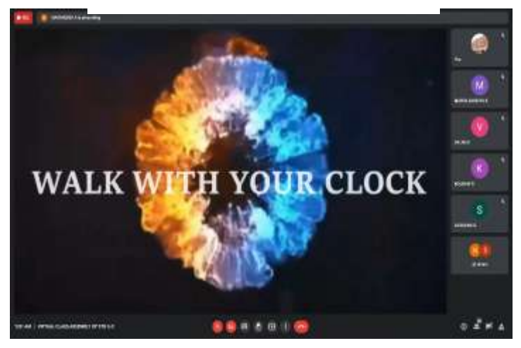
Walk with your Clock