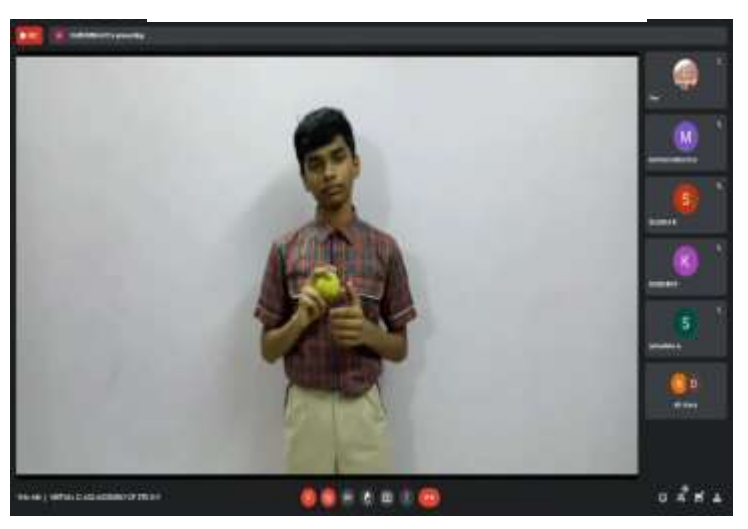
Tag your Merchandise - An Adzap Competition