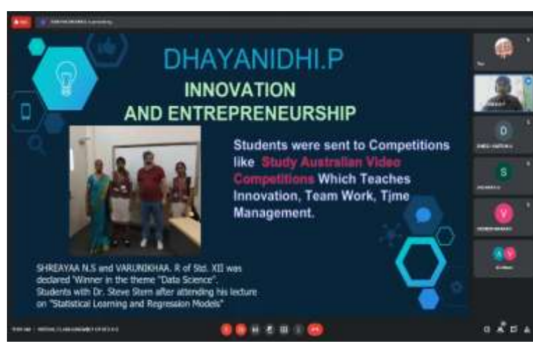
War of Words