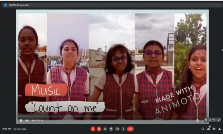
COUNT ON ME – Mesmerizing medley of songs on Compassion