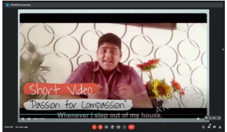
PASSION FOR COMPASSION – Sharing passionate views on Compassion