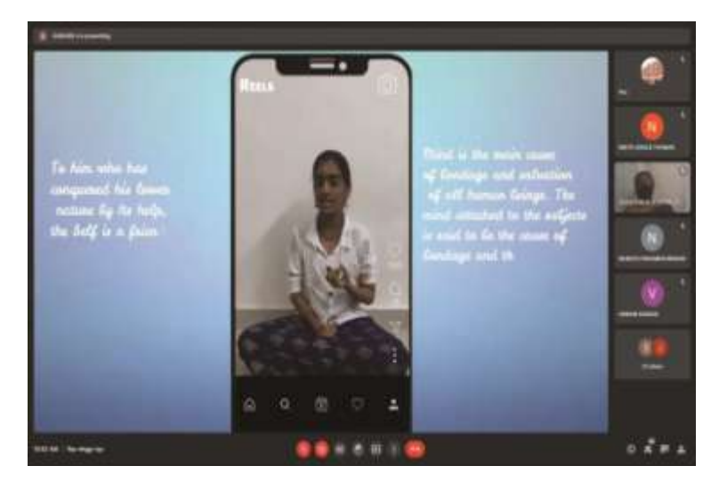
A Special couplet to leash the distractions of the mind