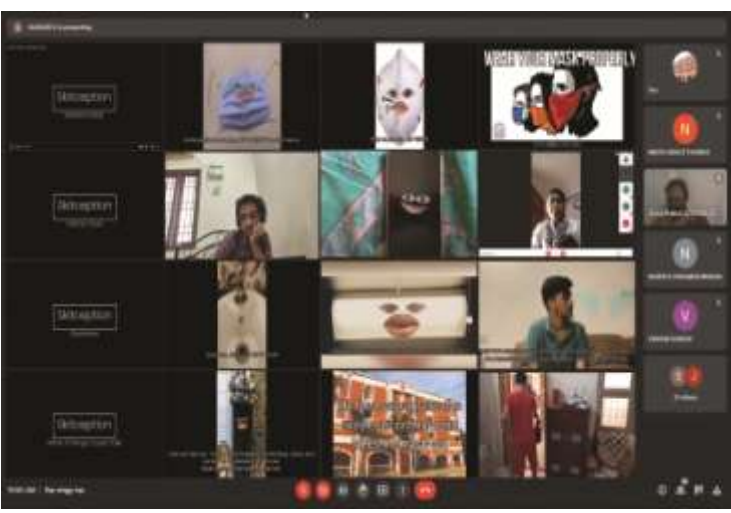
'Latent Voices —a skitception where non-living objects crusaded to heed to the voice of conscience