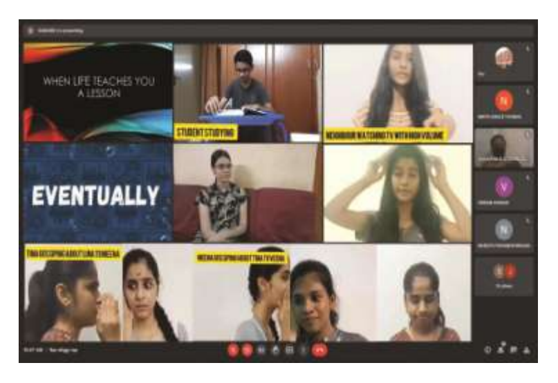
'Lessons of Life' showcased 'karma is a boomerang'