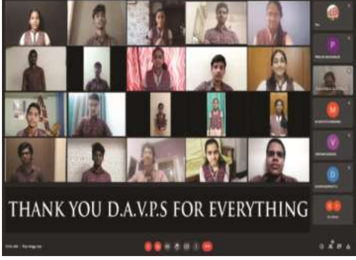
A unique Vote of Thanks on behalf of Std. XII