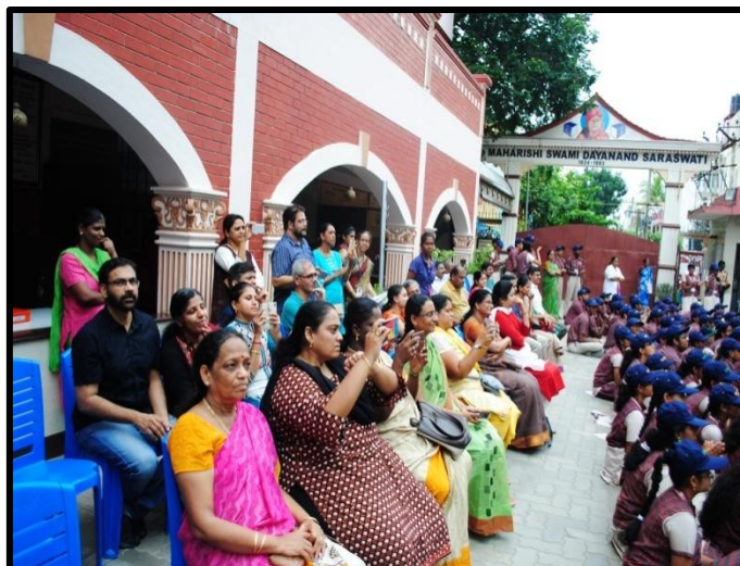
Ecstatic Parents Relish The Visual Treat