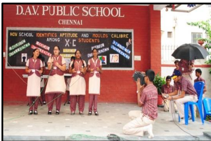
Musical Treat by the ‘Nightingales’