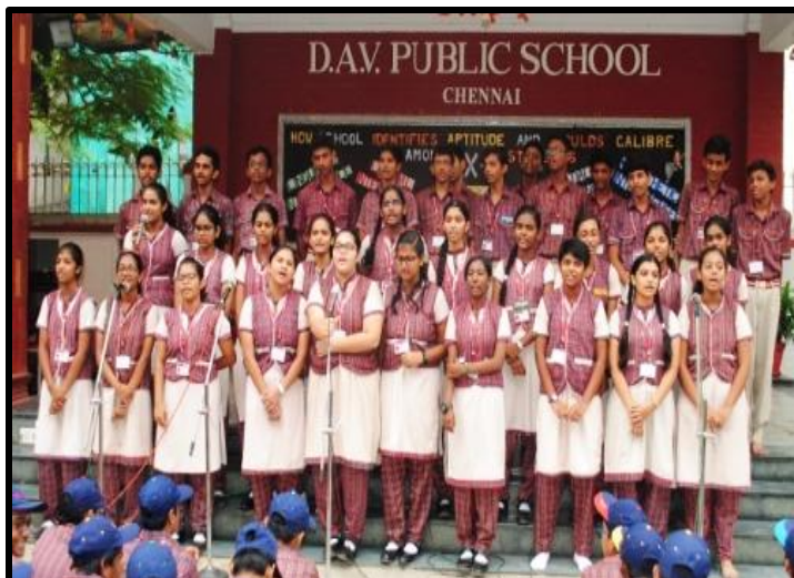
A Self Composed Post Credit Song