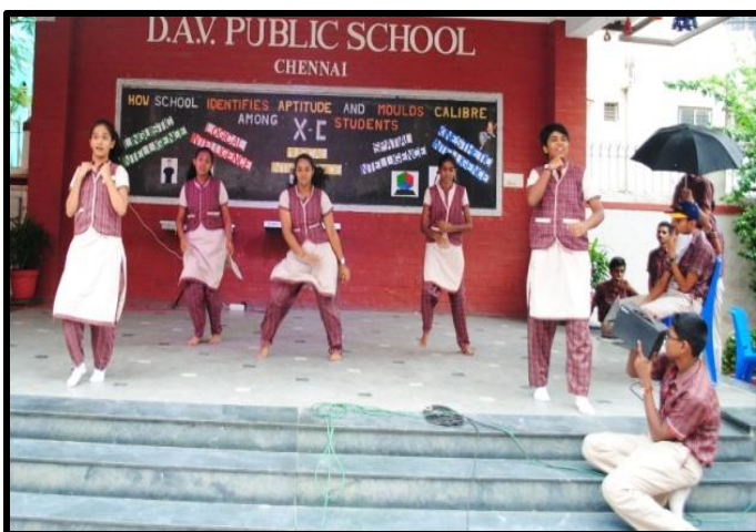
Dancing to the Rhythmic Beat