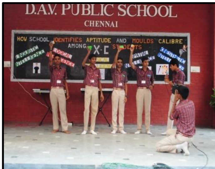
‘Cubing’ – Depicting Logical Intelligence