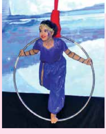
The theme dance with the Aerial Act – Roots to Wings was the highlight of the day and won praise from all.