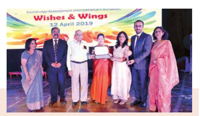
The Most Collaborative Parent Award was presented on the same day. The Award is instituted as a part of the Positive Partnership Programme launched in the school.