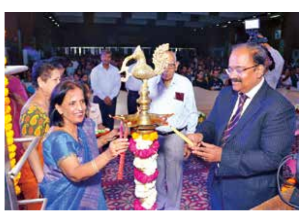
The programme commenced with the lighting of the lamp accompanied by a Classical Dance Recital on sacred mantras.